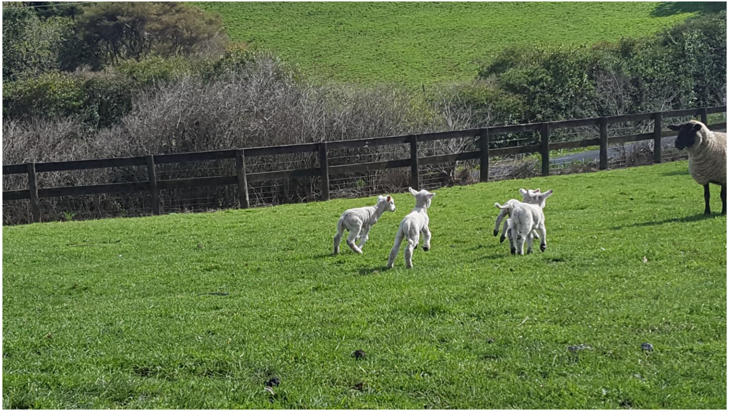
Photo: When the Triplets bring a friend over